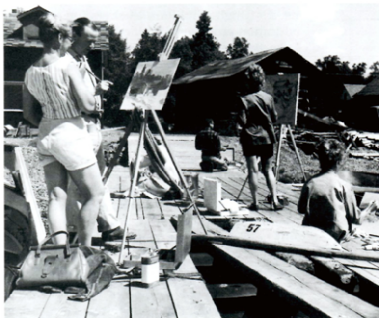
Quick with art students on dock, 1960s

About this time, the art colony took advantage of a bigger classroom space available in the