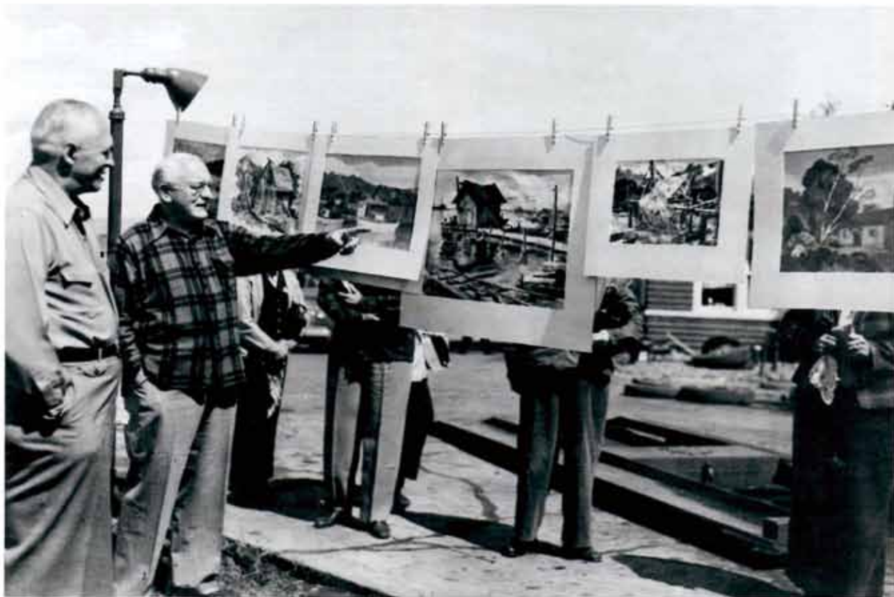
Clothesline art sale in Grand Marais, 1947