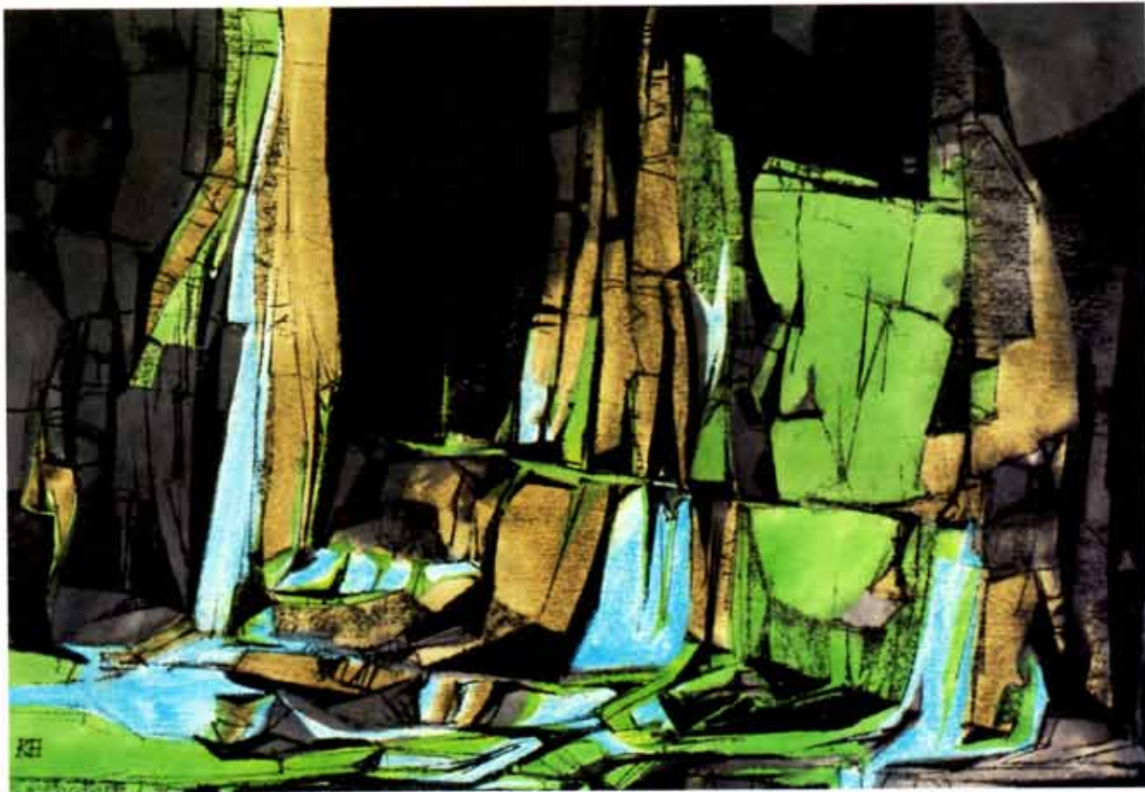
Keith Havens's Rock Wall Study, watercolor and charcoal on paper, about 1970