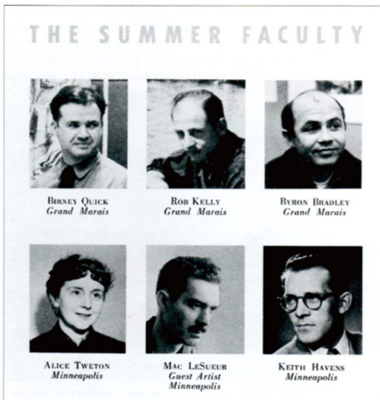
Summer faculty members at the Town Hall Art Colony and Minneapolis School of Art, 1955